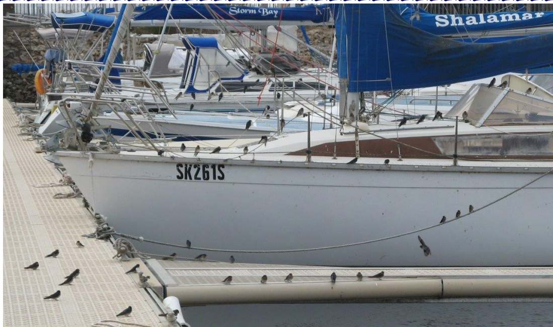
Sometimes mooring your boat in the middle of a bird sanctuary has its drawbacks.