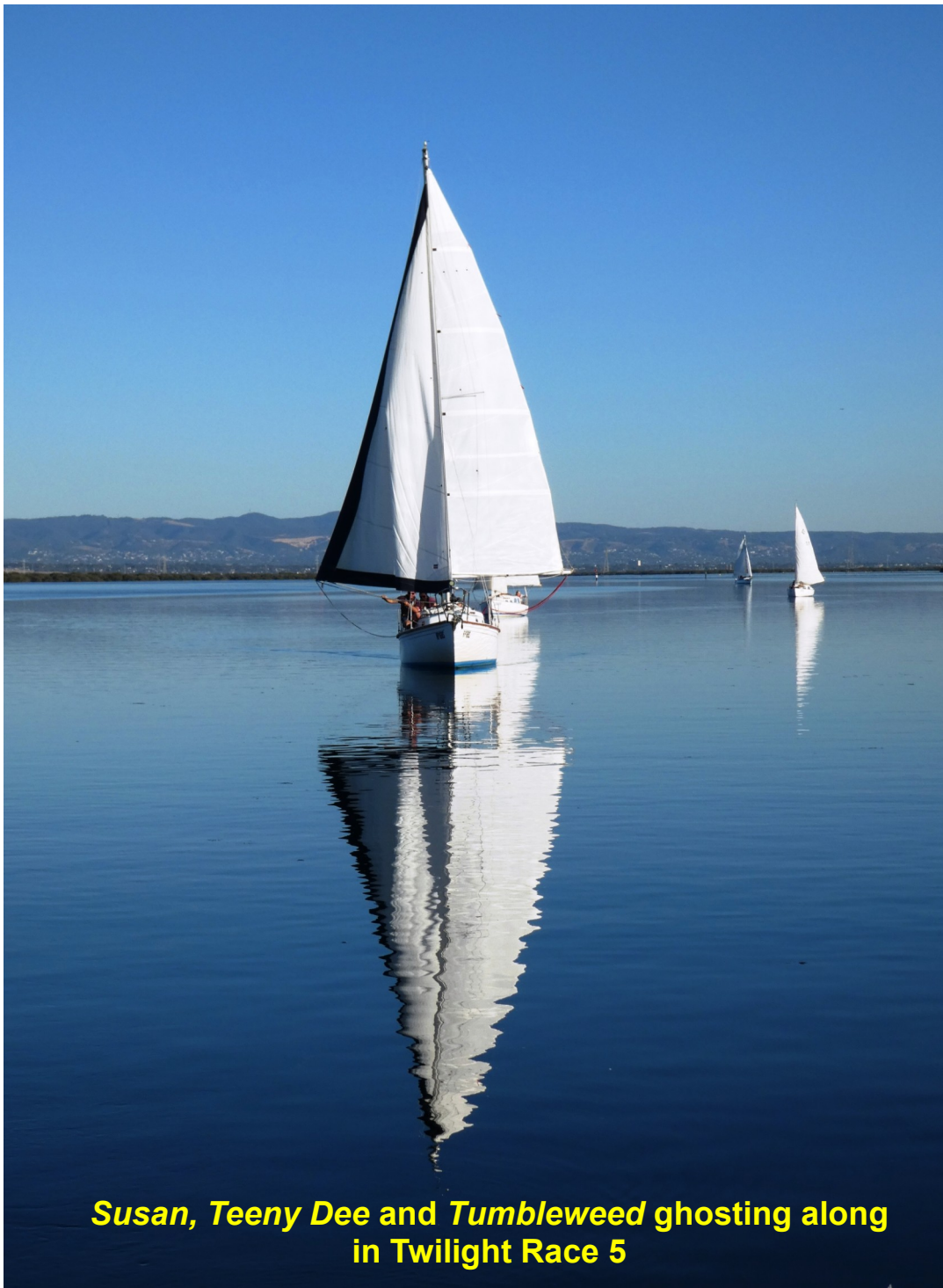
Susan, Teeny Dee and Tumbleweed ghosting along in Twilight Race 5