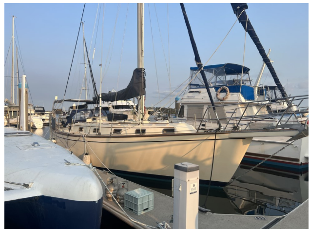
Tin Can Bay Marina