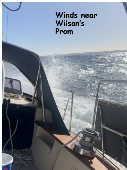
Winds near Wilson's Prom