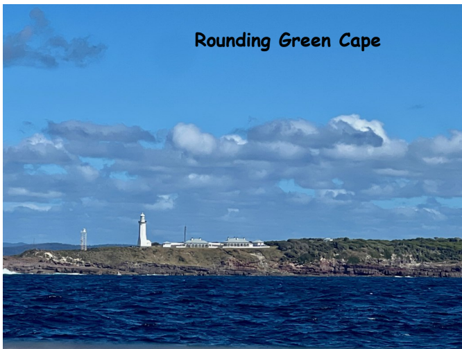
Rounding Green Cape