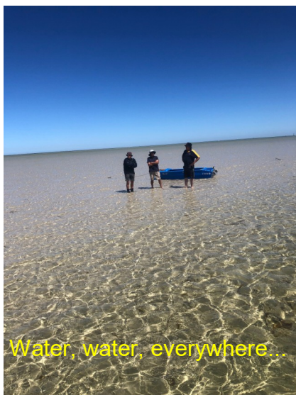
Water, water, everywhere...

Once again the Cricket Crew arrived full of enthusiasm and looking for a sand bar. Fortunately enough appeared to allow the required number of overs to be completed (everyone got to bowl and bat, except the dogs).