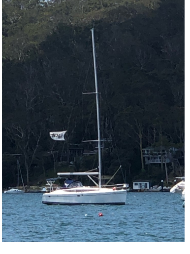
Artemis in Sydney