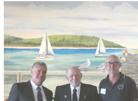
Richie Low Yacht Race Trophy