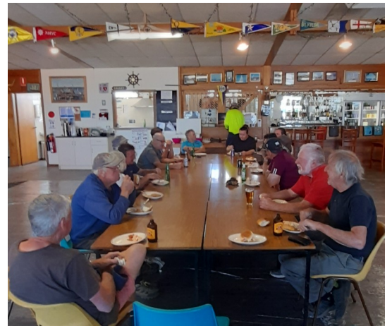
Hungry workers receiving their just rewards.