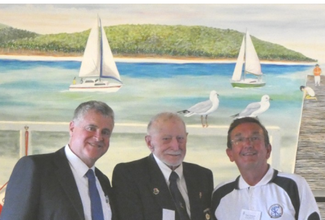
Paul Crouch Yacht Race Trophy