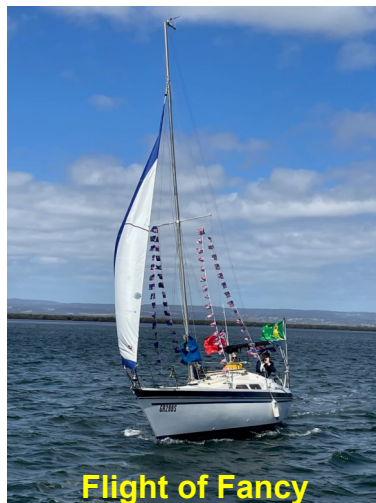
Flight of Fancy