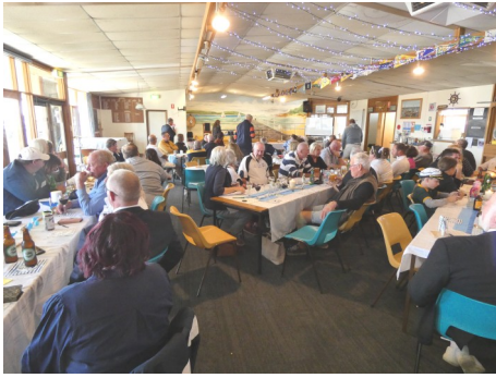
The assembled crowd