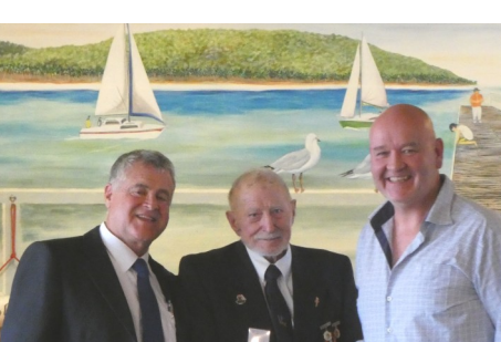
Dan Tucker Yacht Race Trophy