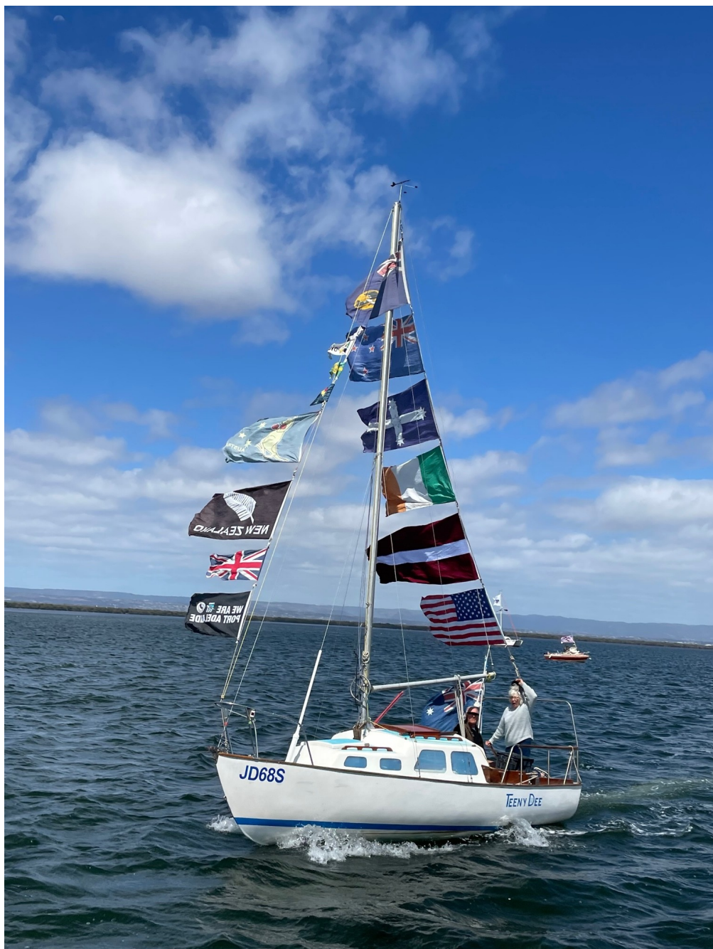
Teeny Dee passing the Committee boat at the Sailpast Opening Day, 22 October