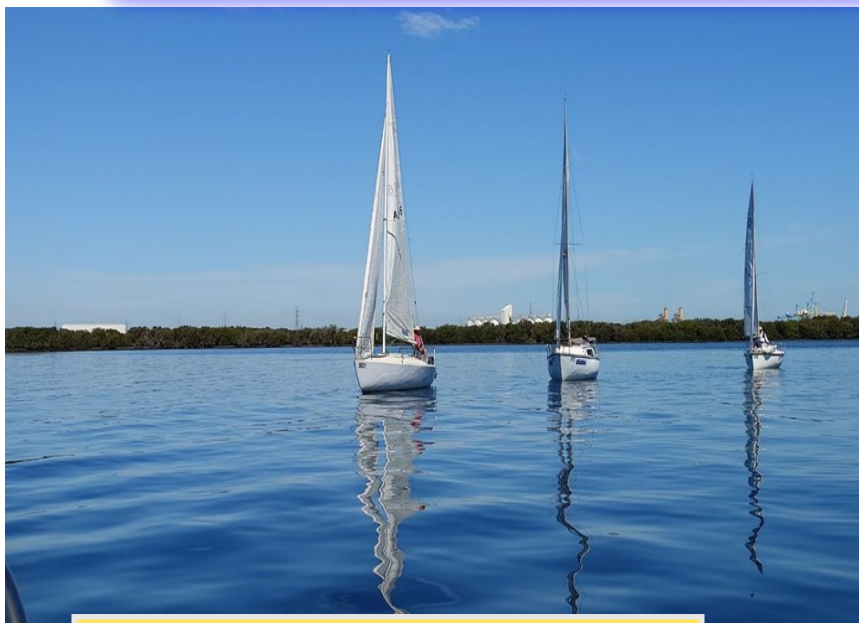
Becalmed - Bullet, Beluga, Dodgem