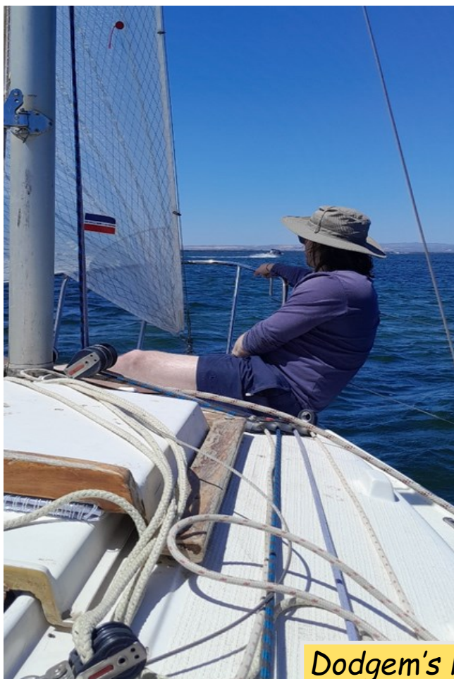
Dodgem's light weather secret - crew on the bow to stop the stern dragging! (shhh...)