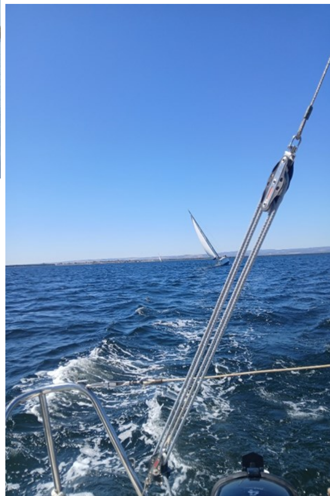
Susan chasing Dodgem - Race day 2 - Race two