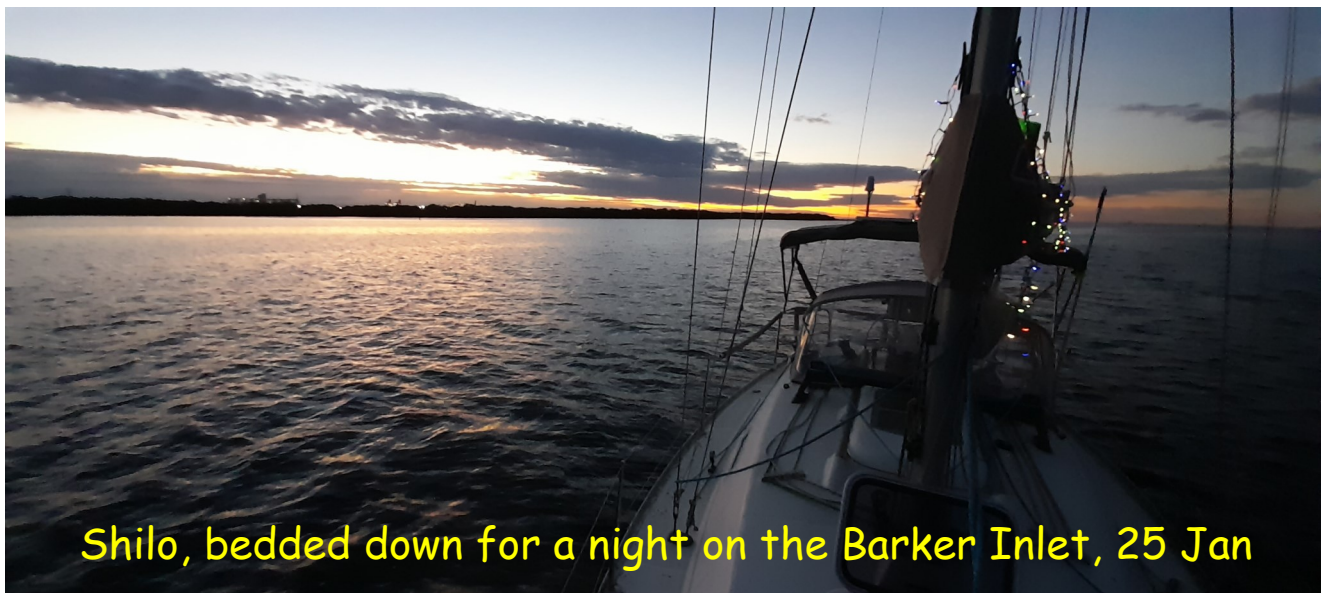
Shilo, bedded down for a night on the Barker Inlet, 25 Jan