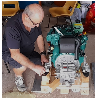
Shiny new Volvo