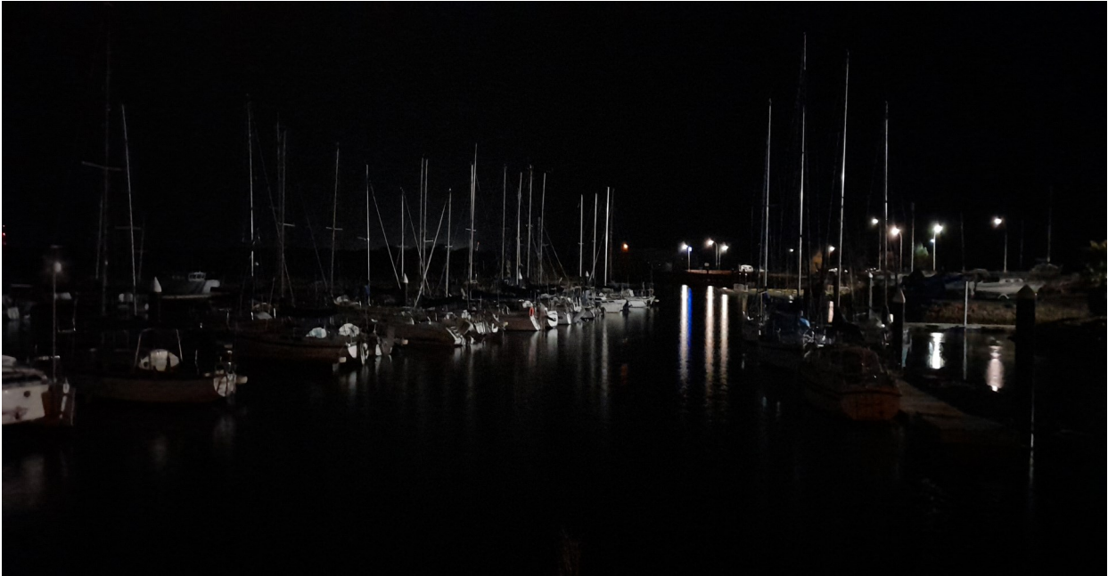
A quiet winter's evening