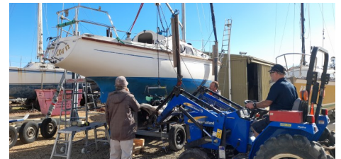
Our versatile club tractor; don't try this at home!