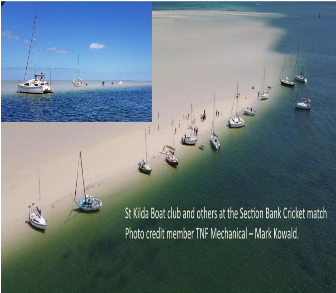
St Kilda Boat club and others at the Section Bank Cricket match