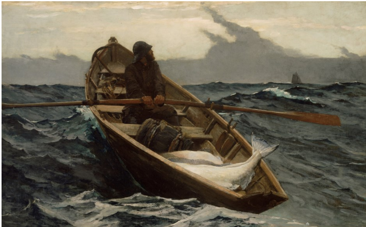
The Fog Warning Winslow Homer, 1885 Museum of Fine Arts, Boston, Mass